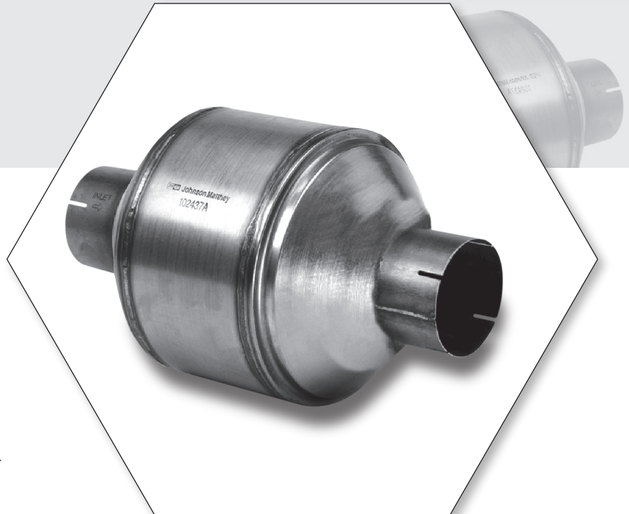
DOC TEST RESULTS

For 40 years, Johnson Matthey has been the global leader in the emissions control industry. Johnson Matthey SEC designs and supplies catalytic systems to control emissions of NO x , CO, NMHCs, VOCs, HAPs and PM.