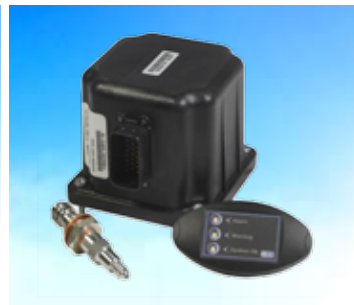
A dv CCRT Doser, Nozzle and LED Display