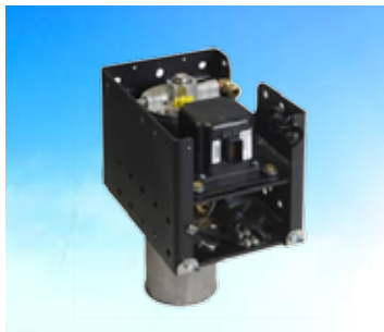
A dv CCRT Doser Combined Mount